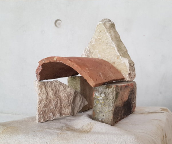
Photos: artists in residence at Pôle danse des Ardenne ( The choreographic center of Ardenne) Sedan (September 2018)